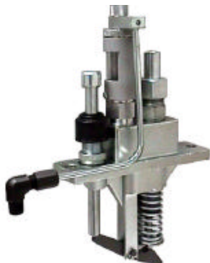
CCT Pressurized Suction w/ Tube to Front or Rear, and Shut Off Valve or Elbow Fitting