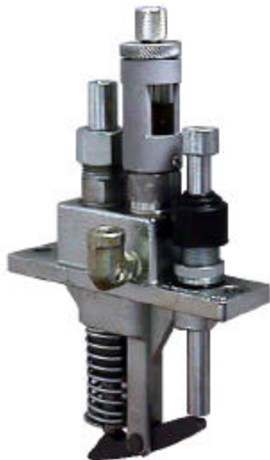
CCT Pressurized Suction w/ Sight Glass, Side Inlet Elbow Fitting