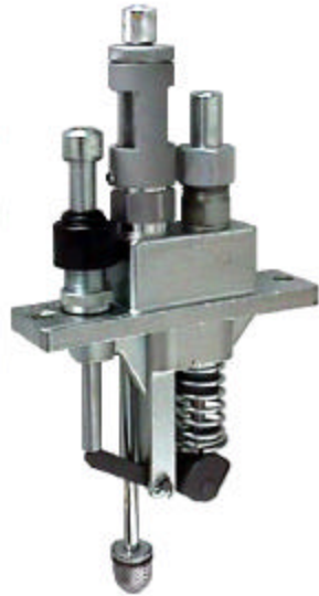
CCT Box Suction (Vacuum Feed), Roller Rocker Arm