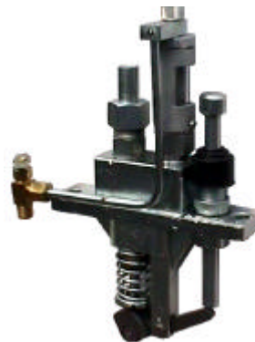
CCT Pressurized Suction w/ Tube to Front or Rear, Shut Off Valve or Elbow Fitting, and Roller Rocker Arm