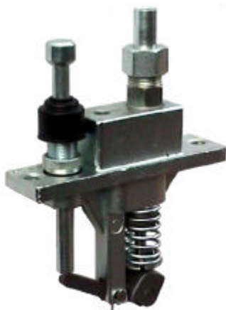
CCT Pressurized Suction (Blind Sightfeed) with Roller Rocker Arm