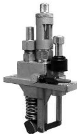
CCT Pressurized Suction w/ Sight Glass, Side Inlet Tube Connection and Roller Rocker Arm